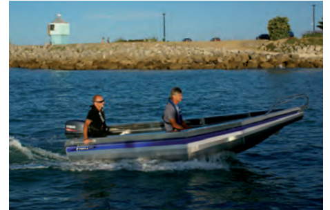
Decals and Colour Stripe